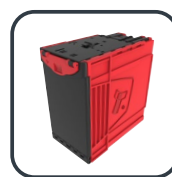
1000 Note PA02931