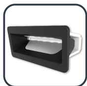
Self Aligning (Black) PA02053