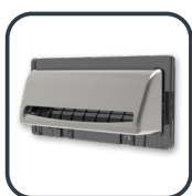
Coin Resistant Pa04224