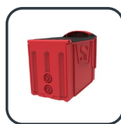
500 Note PA03845