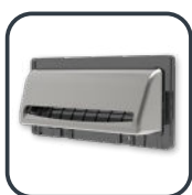
Coin Resistant Pa04224