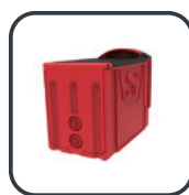
500 Note PA03845