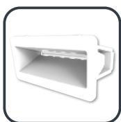
Self Aligning (White) PA01038