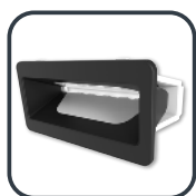
Self Aligning (Black) PA02053