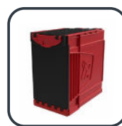
1000 Note PA03849