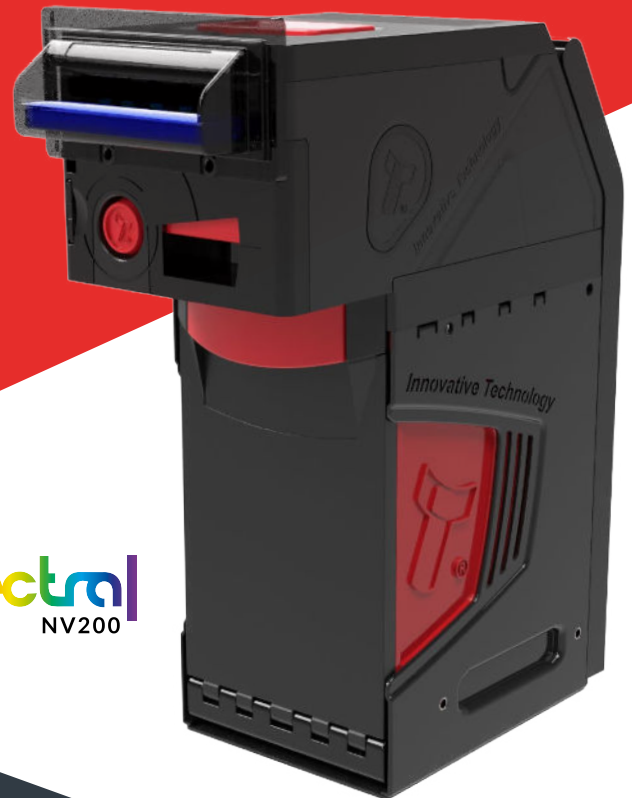
Model shown includes Docking Interface (PA02014)