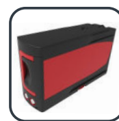
2200 Note PA03345